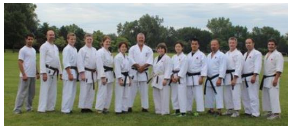
2015 Seminar Attendees